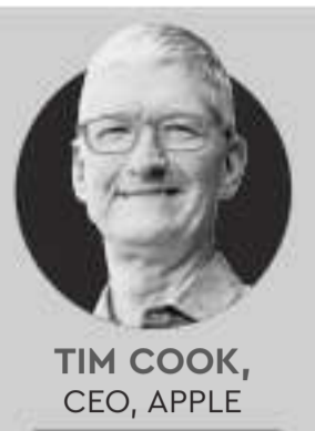
TIM COOK, CEO, APPLE