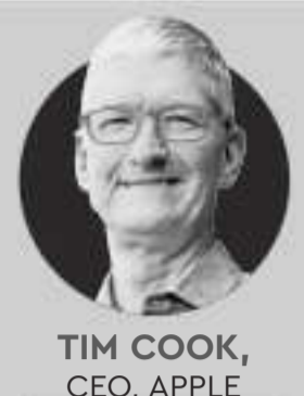
TIM COOK, CEO, APPLE