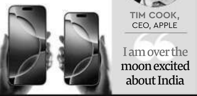
TIM COOK, CEO, APPLE I am over the moon excited about India

Majority of buyers are first-time users across Apple devices